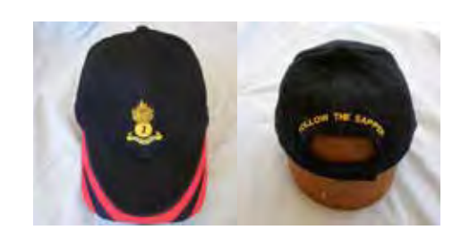
Follow the Sapper Cap - $17.50 + P&H One size fits most.