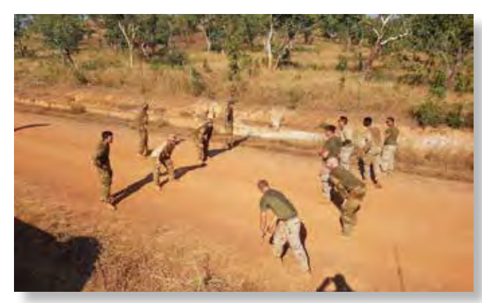
1 Tp hosting a multi-national football match during Ex TIGERS RUN