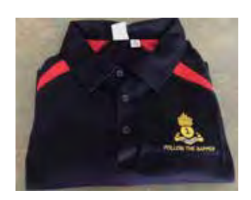
1 Fd. Sqn. Gp. Polo Shirt - $40.00 + P&H Check out the fabric - breathable and definitely no ironing.

Note: Sizes are limited to Small (Suitable for the Girls), Medium, Large & Extra Large