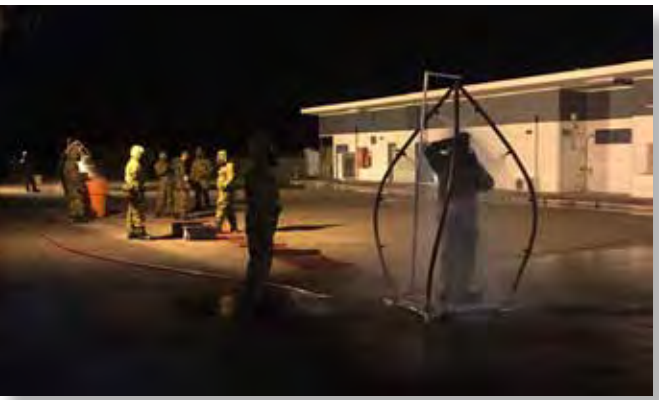
1 Tp conducting early morning PDS

Immediately after setting our charges, we stripped it out and slipped into our MOPP gear. The remainder of the morning (if you can call 2AM "morning") was spent conducting a Personnel Decontamination Station – SPR Smyth taking the lead in setting it up. The PDS went smoothly, however seeing everyone stripped down like that, we might want to consider doing a little more cardio.