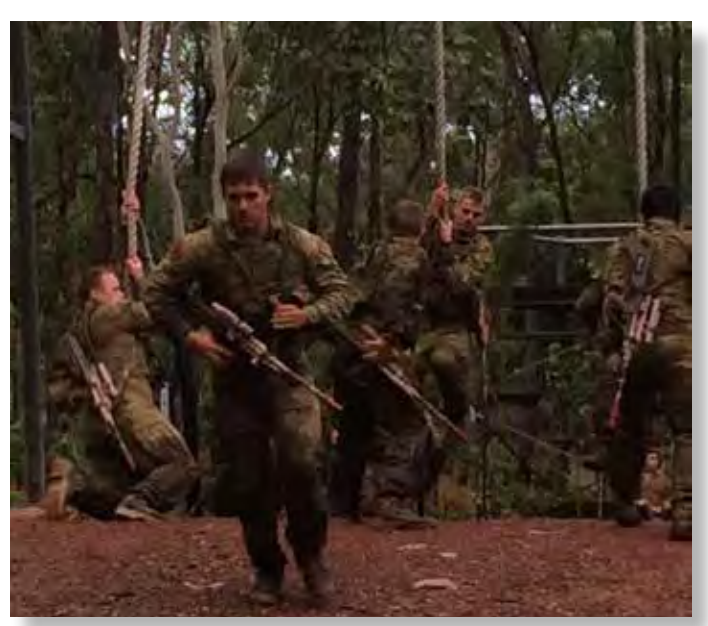
1 Fd members completing the obstacle course during Ex GS