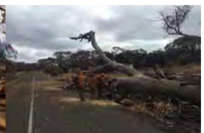
Operation Bushfire Assist.