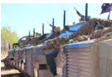
Exercise Goanna Sprint